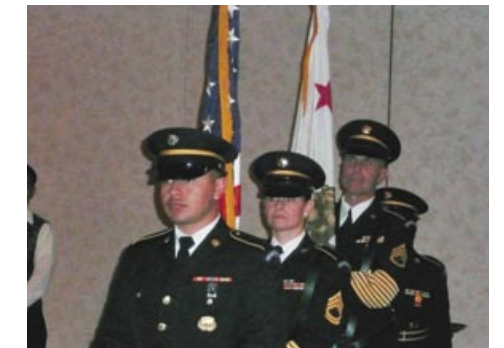
Honor Guard Ceremony