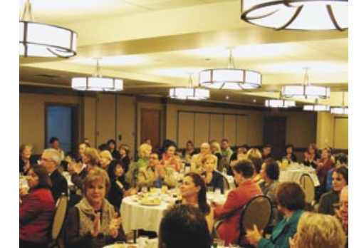
Economic Summit audience enjoying panelists and breakfast at Casa Munras Hotel conference facilities